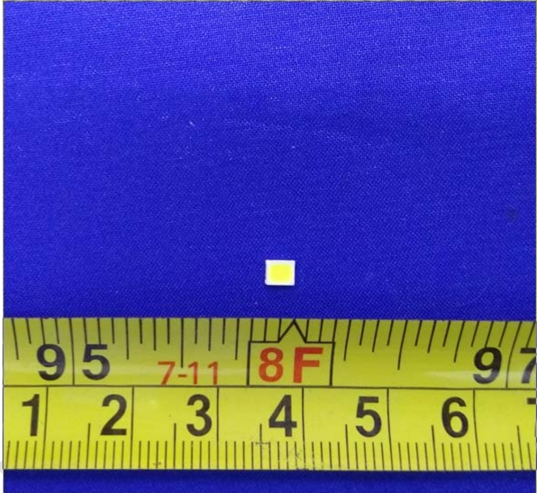
The Whole view of EUT